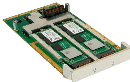
Air-cooled Build Option: 2 x M.2 Devices Fitted