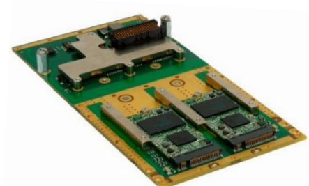
Conduction-cooled Build Option: 2 x M.2 Devices Fitted